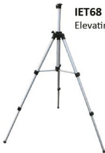
IET68 Elevating Tripod