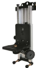
WB5 Wall Mount Bracket